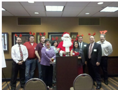
Santa and all of his reindeer during our December 2011 luncheon held at Holiday Inn Monroeville.